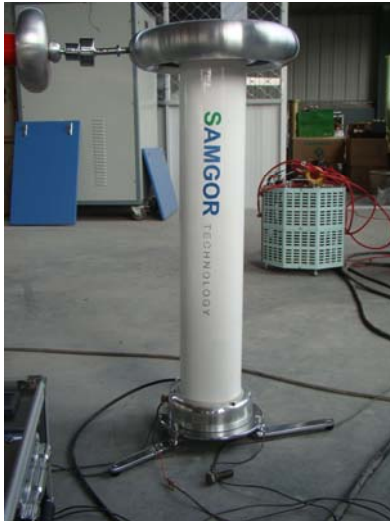
100kV (AC)/150kV (DC) RC Voltage Divider