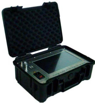
SG3005 Digital AC/DC Peak Voltage Meter

AC/DC KILOVOLTMETERS is an indispensable instrument in every modern high-voltage laboratory and test field where it occupies a wide range of important functions. It is the most basic test for every test in the high voltage test field.